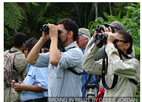
BIRDING IN BELIZE BY DEBBIE JORDAN