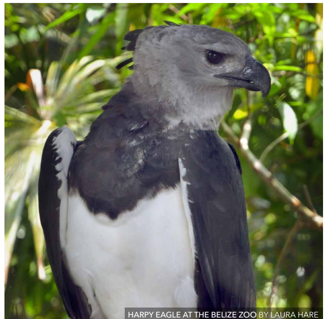
HARPY EAGLE AT THE BELIZE ZOO

inland lagoons, swamps, and waterways. During the dry season, tens of thousands of birds congregate here, taking advantage of abundant food resources in the wetlands. Bird along the lagoon and its tributaries in search of Wood Stork, Jabiru, Bare-throated Tiger-Heron, Boat-billed Heron, Black-collared Hawk, Snail Kite, Neotropic Cormorant, Anhinga, Limpkin, and American Pygmy Kingfisher. After lunch, spend the rest of the afternoon birding in the sanctuary. The pine savannas provide an opportunity to see near-endemics like the Yucatan Jay, Yucatan Woodpecker, and Yellow-lored Parrot, as well as Rufous-browed Peppershrike, Yellow-headed Parrot, Aplomado Falcon, and Canivet's Emerald. Overnight at Bird's Eye View Lodge. (BLD)