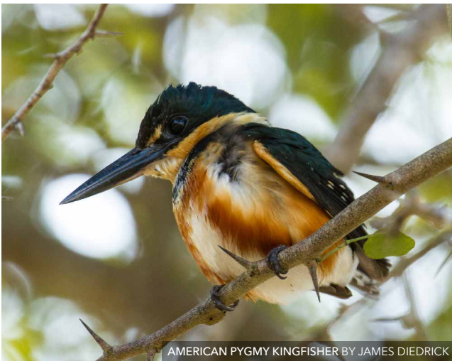
AMERICAN PYGMY KINGFISHER BY JAMES DIEDRICK

Upon arrival in Belize City, after clearing customs and immigration, meet your guide and transfer to Crooked Tree. Arrive at Bird's Eye View Lodge and check in. Receive an orientation to the program before dinner at the hotel. This evening search for potoos, owls, and nighthawks during an evening birding exploration around the lodge. Overnight at Bird's Eye View Lodge. (D)